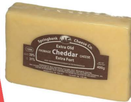
Extra Old Cheddar 400g