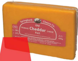
Old Cheddar 400g