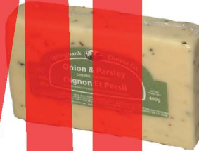
Brick Onion & Parsley 400g