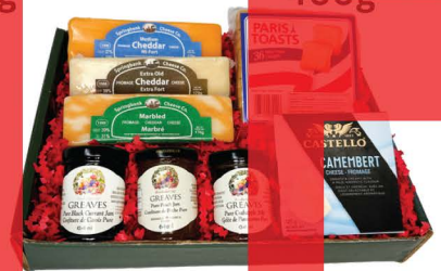
Gift 3 - $60.00 Tasty Canadian & European Treats