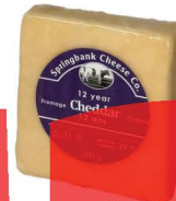
12-year-old Cheddar 200g