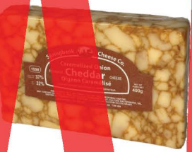
Caramelized Onion Cheddar 400g