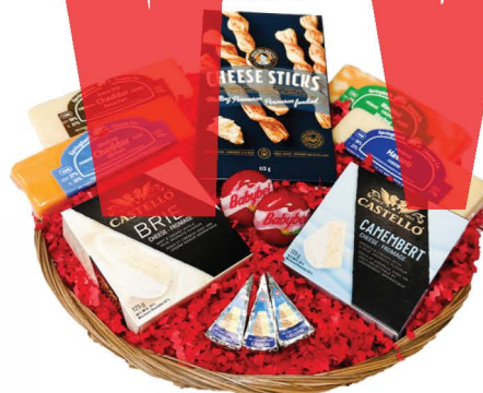
Gift 4 - $85.00 Gourmet Fare