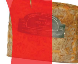
Pizza Blend Shred 400g