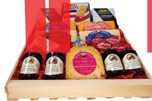
Gift 5 - $115.00 International Flair