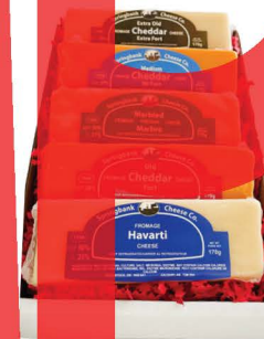
Gift 2 - $40.00 Canadian Cheese Lovers' Collection