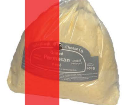
Grated Parmesan 400g