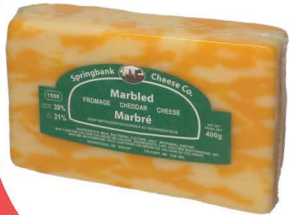
Marbled Cheddar 400g