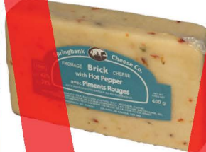
Brick Hot Pepper 400g