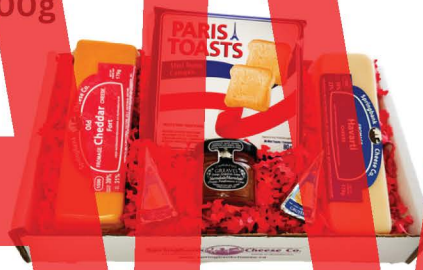
Gift 1 - $30.00 Crackers & Cheese Please

All of our gifts are attractively boxed.