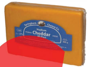
Medium Cheddar 400g