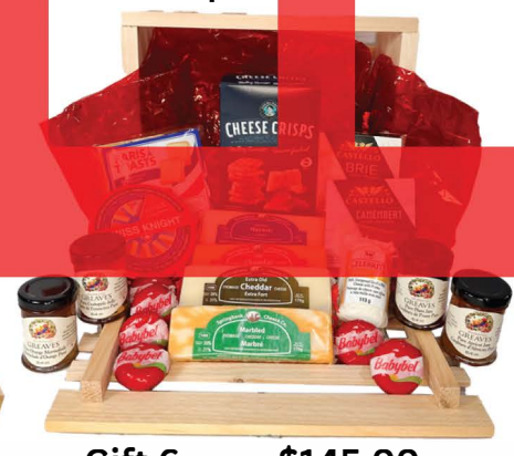
Gift 6 - $145.00 Buried Treasure